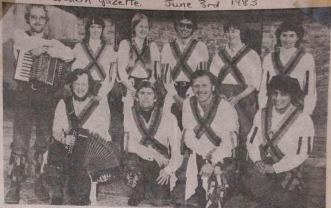
THE first public performance by the new Crewkerne-based Morris dancers, Dr Turberville's Morris, took place at the opening for the summer season of Chard Museum. See lead Diary story.