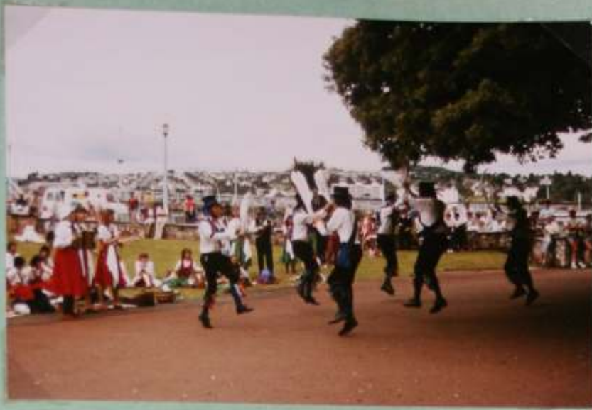
← GREAT WESTERN AT PRINCESS GARDENS DORQUAY