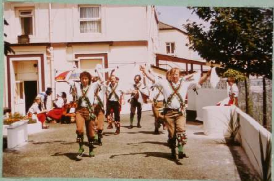
DR TURBERVILLES → AT THE WEARY PLOUGHMAN CHURSTON