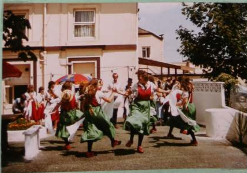
← DORSET BUTON'S AT THE WEARY PLOUGHMAN CHURSTON