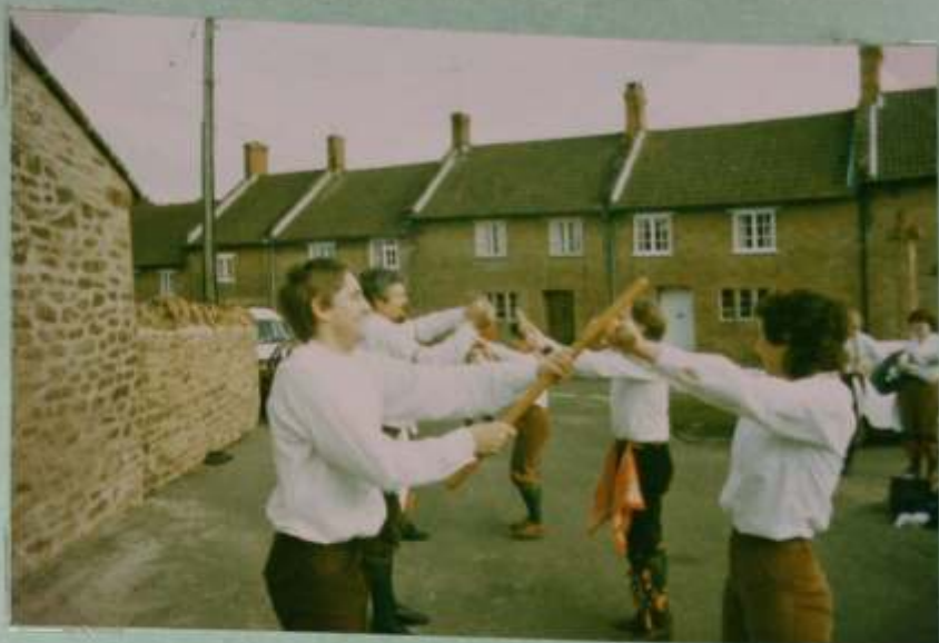
MANOR ARMS NORTH PERROTT SUNDAY 24 APRIL