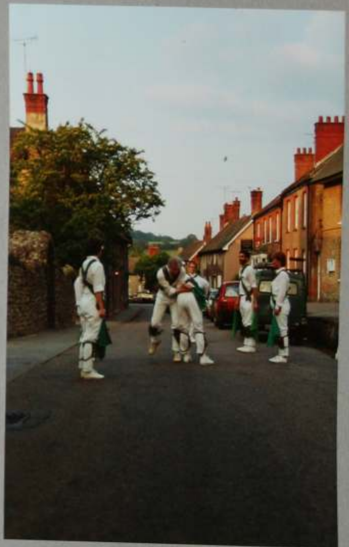
ONE RECYCLED MORRIS PERSON ON THIS PAGE