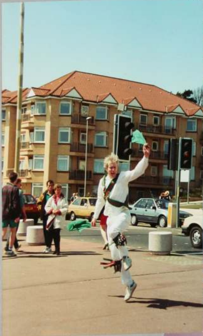
Along the seafront...