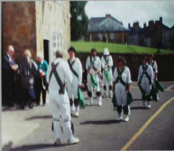
A Bampton Hankie dance