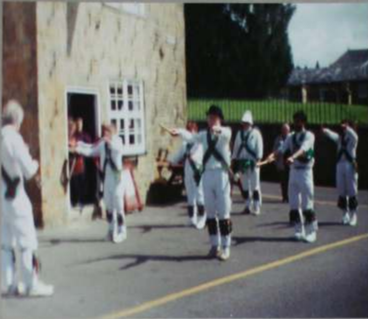
A Hinton stick dance

ST. GEORGE'S DAY, 23RD APRIL, AT THE FROG + SLATE, ILMINSTER - IN AID OF SAVE THE CHILDREN