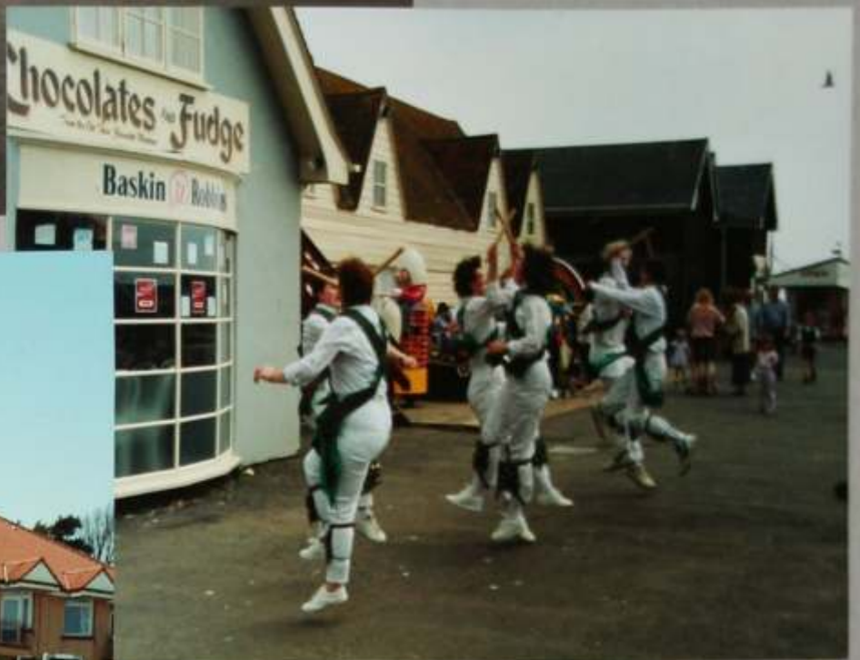
Typical Turbs, outside the Ice-Cream Parlour