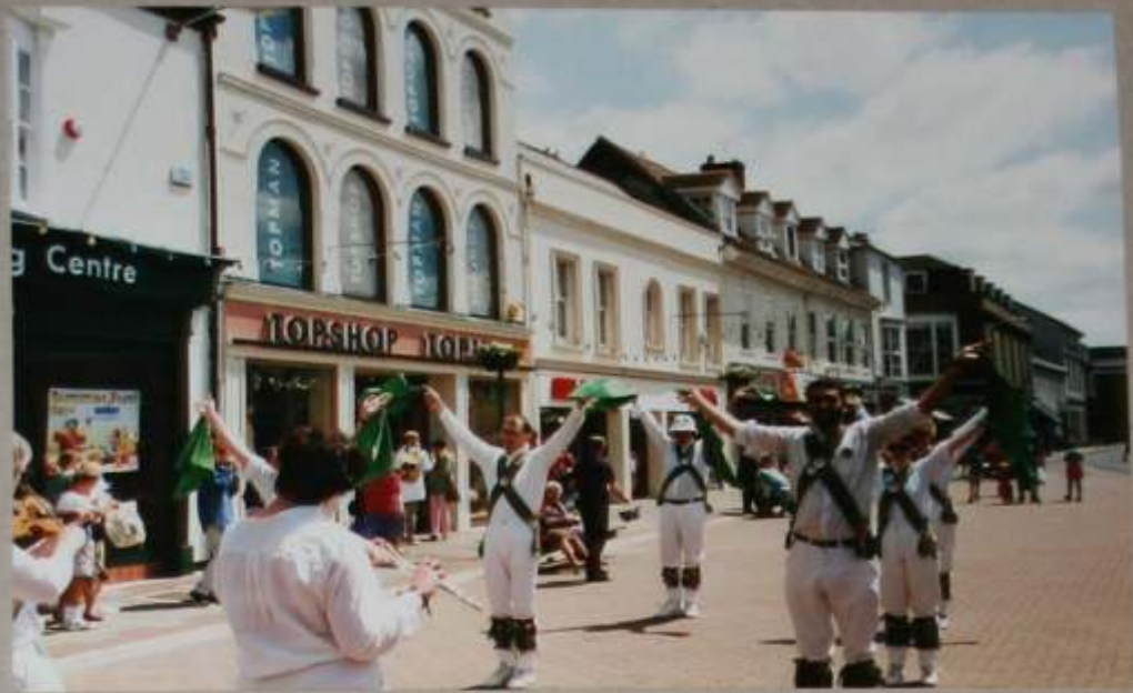
Crash, They've all stopped together!