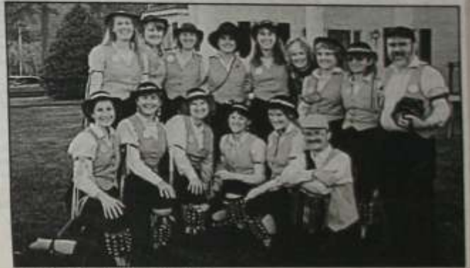
● THE dance group in Vermont.

For more varied folk dance from all over the world, and some excellent singing, too, the 41st Sidmouth Festival gets under way tomorrow, and between then and next Friday, a host of acts from the five continents will be performing at concerts, ceilidhs, work-